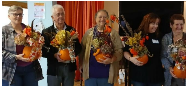
Antigonish Garden Club members with Pumpkin Centre pieces made at District 2 - Fall Rally.

Fifteen members from Antigonish attended the District 2 - Fall Rally , where we enjoyed meeting people from other Clubs, listening to varied and interesting speakers, and enjoying a generous and tasty lunch. Members noted that while we are all committed gardeners, every Club has a different style and a different focus, so we can learn so much from each other. Creation of the Pumpkin Centerpieces over lunch was very enjoyable, and we would like to congratulate the Westville Club and Area Garden Club for organizing such a pleasant day.