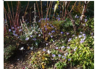
Autumn Crocus - Photo courtesy of Carol Morrison.

I will leave you with a photo of autumn crocus from our past president’s garden. We look forward to a quick return of their spring counterpart.