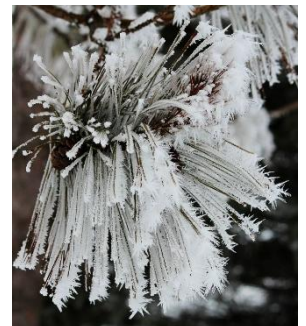
Nature in Winter – 2 nd in Class - Bill Reader