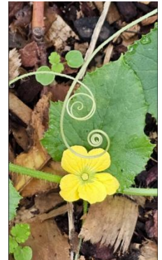
Vienie McShane - Class 3

Have fun selecting your entries for the NSAGC 2026 Photo Contest and we look forward to seeing all your beautiful photos.