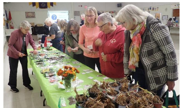
October seed, tuber and rhizome exchange.

Volunteers – A few Club members volunteered their time to do some instruction and planting of bulbs at the local Soul's Harbour site. We also did a garden clean up and bulb planting at our local cenotaph , ahead of Remembrance Day.