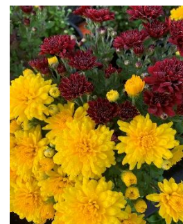
Fall Mums