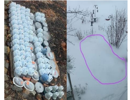
All set for the winter and covered with snow.

I start my winter sowing anytime after mid January when the Holidays are behind me and my fingers start itching to get into gardening again.