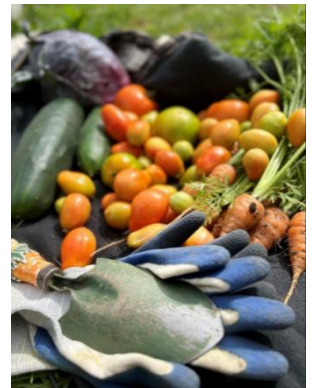
Mia Muise - Class 5

In all other matters the owners of the photo(s) will retain their rights under copyright law. If you choose to include people in your submission, you are responsible to obtain the necessary release from the individual(s) depicted.