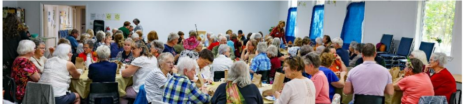
Full House