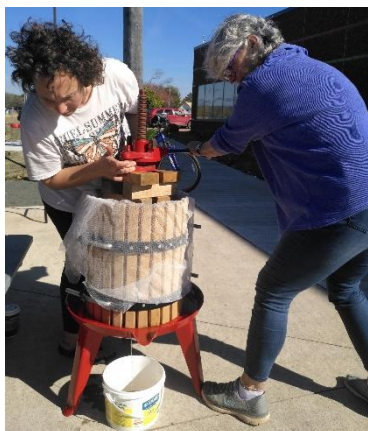
Hard work pressing apples!

Our October 6 th meeting was a beautiful autumn day where Club members pressed apples! What fun, and a lot of work! With the generous loan of an apple press for the day, and we set to work. Putting the press together was quite a task. While that was happening, the rest of us were cutting up the apples nice and small, and then some went through a meat grinder to mush them to start the process of juice extraction. Then off to the press. Next came the challenging work part – turning the press required a bit of muscle! We watched in anticipation for the first trickle of juice to come out of the spout and lo and behold, there it was – then more emptied into our bucket – while our intrepid pressers kept up turning the press. We all enjoyed the day and took home some lovely fresh apple juice at the end of the meeting.