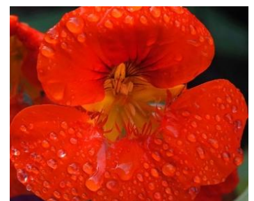
Water in Garden – 3 rd in Class - Tim Geddes